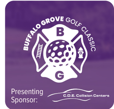
The Arboretum Club August 6, 2025 Partnering with the Rotary Club of Buffalo Grove