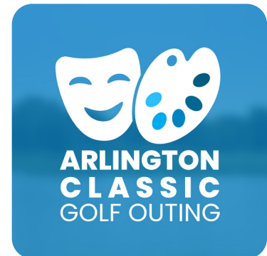
Arlington Lakes Golf Course September 11, 2025 Partnering with the Rotary Club of Arlington Heights