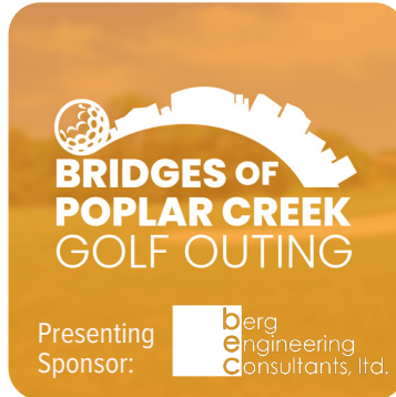
Bridges of Poplar Creek Country Club June 25, 2025 Partnering with the Rotary Club of Schaumburg/Hoffman Estates