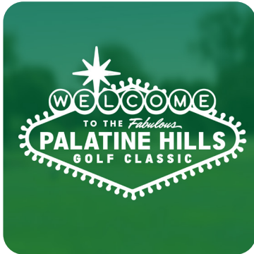
Palatine Hills Golf Course June 5, 2025

We exist to support children and adults with disabilities through philanthropy for Northwest Special Recreation Association