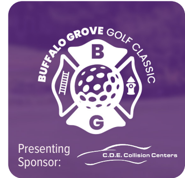
The Arboretum Club August 6, 2025 Partnering with the Rotary Club of Buffalo Grove